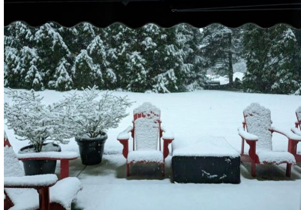
Spring in BC – version two